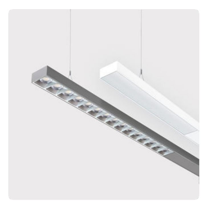
Illustrations may only be similar and serve as an orientation.

Matric-G7. LED. Pendant luminaire. Luminaire body made of high-quality aluminum profile. Surface finish Snow White. Direct only light distribution. Colour temperature: 3000K (Warm White). Colour Rendering Index (CRI): >80. Lens Louvre: precision lenses with louvre. High glare limitation, compatible for office applications. Reflector: Satin Gold. Dimmable DALI. LxWxH (light line). L=1585mm. W=81mm. H=40mm. Y-cord suspension with power supply cable and ceiling rose (Set). Pendant length