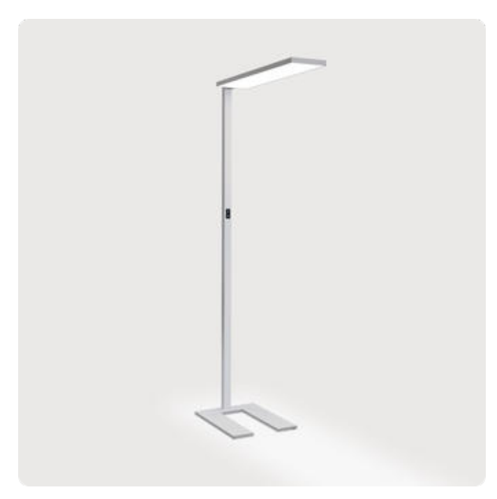
Illustrations may only be similar and serve as an orientation.