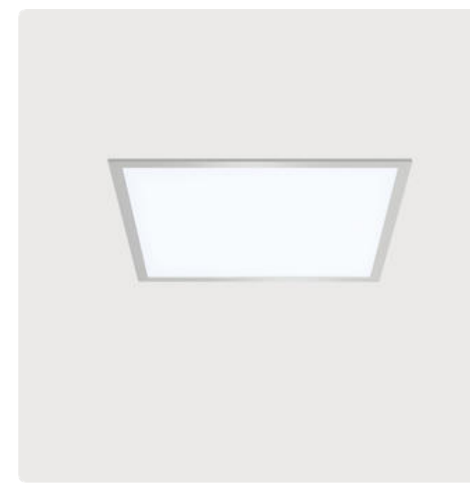
Illustrations may only be similar and serve as an orientation.

Cubic-M4. LED. Recessed mounted luminaire with surrounding frame for installation in ceilings with cut-out openings. Mounting brackets included. Luminaire body with increased stability for installation. Surface finish Silver Anodised. Direct only light distribution. Colour temperature: 3000K (Warm White). Colour Rendering Index (CRI): >80. Microprismatic screen for uniform illumination and reduced luminance in office areas. UGR<=19. Switchable. LxWxH (square). L=621mm. W=