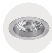
S Radiant Silver S Radiant Silver