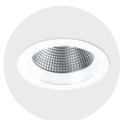
W Snow White W Snow White