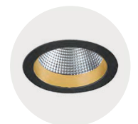
B Jet Black G Satin Gold