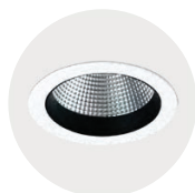
W Snow White B Jet Black