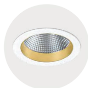
W Snow White G Satin Gold