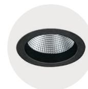
B Jet Black B Jet Black