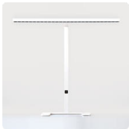
Table light - Direct light distribution